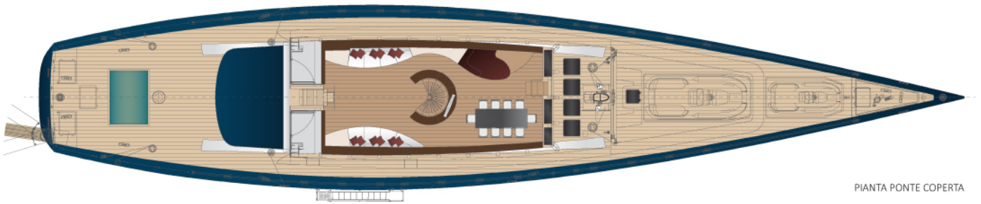
PIANTA PONTE COPERTA