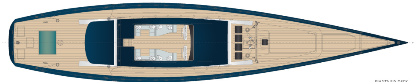
PIANTA FLY DECK